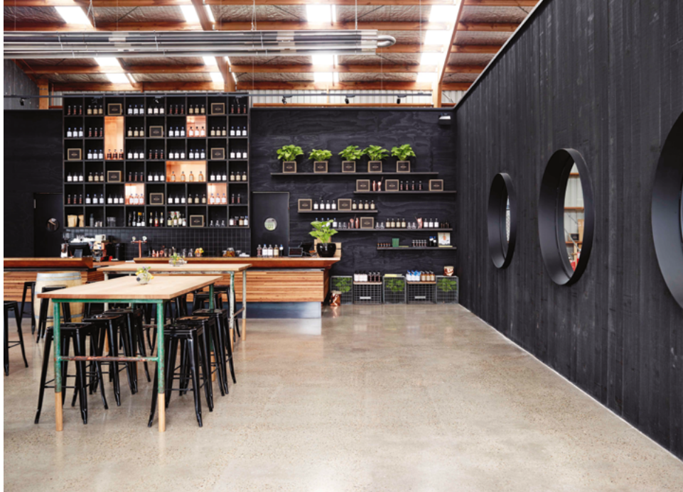
(From above) The industrial-chic look of Four Pillars; Bright Brewery